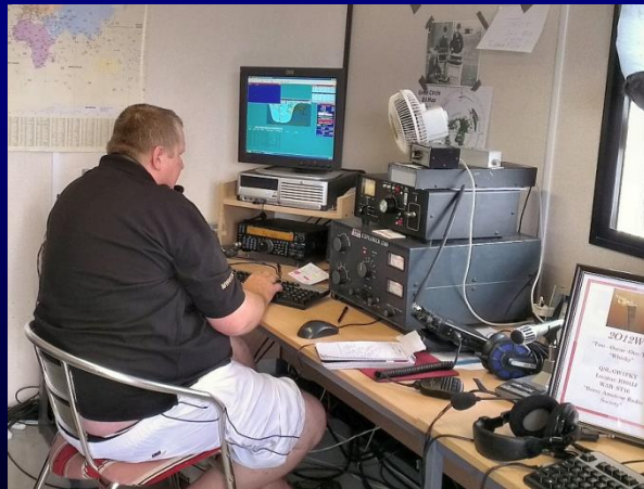
Olympics & Amateur Radio