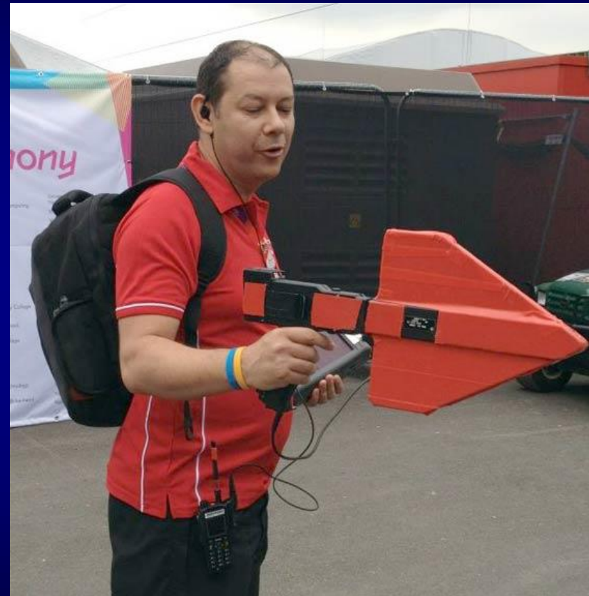
Engineer with Agilent FieldFox & R&S Antenna aka 'the Wi-Fi Police'!