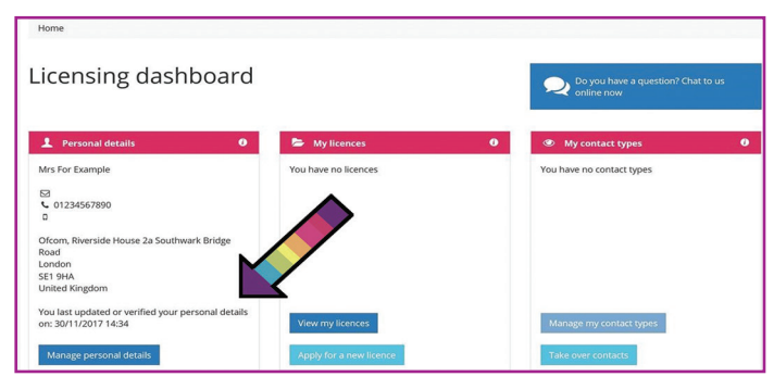
The arrow on this diagram shows the last date on which your licence details were validated.